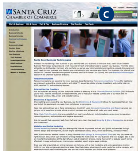
(C) Chamber Website Banner Ad $200/year (468 x 60 pixels)