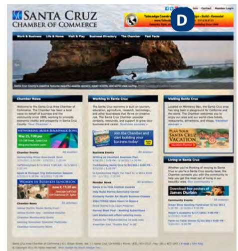
(D) Home Page Banner Ad $500/year (468 x 60 pixels)