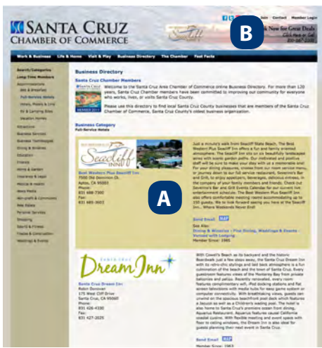
(A) Enhanced Business Listing $200/year