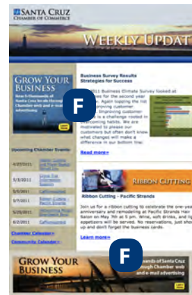
(F) Weekly E-News Blast $50/week (191 x 191 or 280 x 120 pixels)